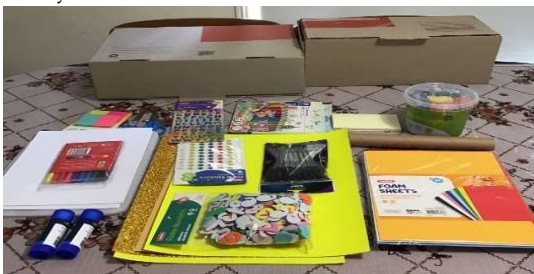
Figure 1:Kit materials of our probes

As we were aware that privacy and personal information are very important factors for refugees, we started our workshop by emphasizing that their privacy was our priority and no names would be revealed to a third party as written in the consent letter. We started our workshop by providing a brief explanation about the aim of our research and all activities that would be carried out during each workshop. We explained to them that the findings of this research would bring technological and practical implications to inform technology designers and service providers to deal with challenges that refugees face in the host community.