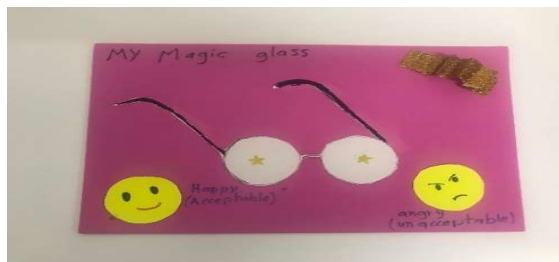
Figure 6: My magic glasses to connect with the host community

Their needs for a training program and engaging in the workplace in Australia were obvious through their discussion. Such needs motivated them to think about a magic machine that could help to provide the training program and gain the skills for their dream job. Finally, they decided that such devices would have to be used in special cases with refugees who already had qualifications and experience in their job in their home countries and who needed to gain skills in Australian workplaces. In another example, participants designed magic glasses to communicate with people in the host community. The magic glasses machine could analyze the personality of any person and notify the user if that person is friendly or not. The magic glasses had simple features, a happy face for people who are friendly, and an angry face for unsociable and unfriendly people (Figure 6).