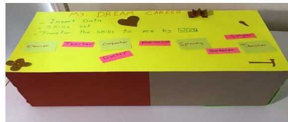
Figure 5: Magic Machine "My dream Career"

Participants were very concerned that their personal information might get hacked when they used the supernatural device (that they designed in workshop 1) to deal with the information-seeking problem. There was a debate among participants about the best way to protect their information as this device contained personal information about all participants. They suggested including four levels of security protection: fingerprint, biometrics, voice recognition, and password.