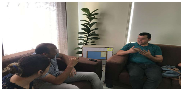
Figure 4: An enacted magic machine for information-seeking scenario

Finally, participants started by modeling their device on paper and identified its functions. They decided the following features would be available in the interface of their magic device, namely, language, Centrelink services, transportation, school services, shopping, community, health services, booking and job regulations. After building their magic device, participants called it, "Refugee Assistant in Australia" (Figure 3). To solve the English barrier, the magic device worked using voice commands in the refugee's language through a magic ring that worked by receiving the commands from the user and transferred them to the magic device. To bring the future to the present and make their device more tangible and plausible, we asked participants to write and enact a scenario about using their magic device. We also requested them to choose two persons to enact the scenario. After a short discussion, participants chose the problem of enrolling their children at school (Figure 4).