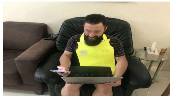
Figure 9: Enacted magic vest scenario

To enact their future in the present and to make their device more realistic, we asked participants to write an enacted scenario about using their device in a real environment. Our intention in this activity was to collect more information and experience from the participants about using their device. We asked them to write a short-enacted scenario about using the magic vest. After a short discussion, participants chose a scenario about how this magic vest could help a refugee to find a job (Figure 9). P9 decided to enact the scenario of an electrician who was searching for a job. When he wore the magic vest, he received several notifications on his mobile phone and his laptop about people who were looking for an electrician. Notifications included information about the job, the location, contact numbers and prediction of hazards.