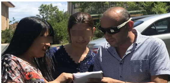
Figure 7: Enacted magic glasses Scenario

After finishing their design, ethical questions were raised about this magic device. P4 shared his concern with other participants about the magic glasses, he said: “Reading people’s mind could be dangerous and not ethical. I think such technology makes me scared about technology in the future. Using such technology means there is no privacy, but it could be beneficial for refugees to connect with the host community”. P3, on the other hand, does not agree with him, he said: “Like any other technology there are advantages and disadvantages, it is depending on us how we would use it”.