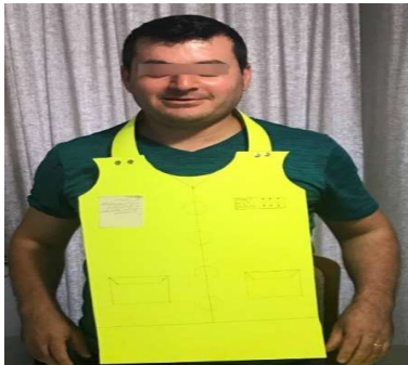
Figure 8: Magic Machine “Smart Vest for Refugees”

of communication or monitoring health conditions. Participants rejected the idea of implanting a device inside the human body for religious reasons. P8 commented on this idea, she said: “In our faith making changes to our bodies that created by God is prohibited but we can use wearable devices instead of an implant” . Other participants agreed with her, and then one female suggested to replace the implant device with wearable devices such as a bracelet. This idea was also rejected by male participants because males in their culture usually do not wear a bracelet. Finally, participants agreed to replace the idea of an implanted device with a magic ring as the ring can be worn by both males and females.