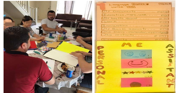
Figure 2: Supernatural device to connect refugees with government services and community

For instance, P3 commented: "most government services that available online contain multilanguage including the Arabic language, but the problem is the language is not accurate and does not match the meaning in English" . To solve the English language problem, participants discussed the main functions that need to be available in this device such as languages, documents, education, health records, immigration details, bank accounts, calendar and events, and community.