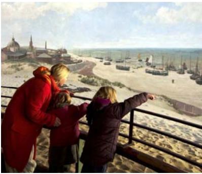
Figure 1. Panorama Mesdag is a master piece by Hendrik Willem Mesdag (1831-1915) that is situated in The Hague, the Netherlands. It provides a 360° view of a 19 th century Dutch village – Scheveningen. For visitors, the artwork depicts an almost similar photographic representation of the architecture and seascape of Scheveningen 125 year ago.

2. British philosophers like Bertrand Russell and George E. Moore were the promoters of the analytic philosophy. An account on the contrast between pragmatist aesthetics and analytical aesthetics is presented in [26].