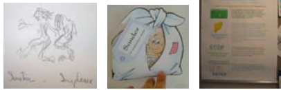
(a) (b) (c)

Figure 5: Characteristics of awareness information, (a) representing the personal history of a senior researcher, (b) representing a playful act of celebration from a secretary and (c) representing a work related activity as a research poster