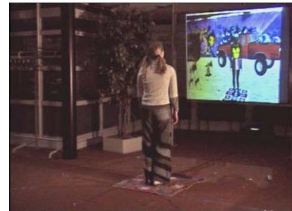
Figure 7: The Virtual Dancer installation

The Virtual Dancer [24] is an interactive dancing agent. It dances together with the user, aligning the appropriate dance moves in real time to the beat of the music, adapting its style to what it observes from the user through real time computer vision techniques. See Figure 7. By alternating patterns of following the user and taking the lead with new moves, the system attempts to achieve a mutual dancing interaction. The Virtual Dancer tries to invite and engage the user, with the sole purpose of having a dance. We see dancing as an entertaining form of task-less interaction. We aim to evoke an intuitive and seamless interaction between the dance movements of a user and the Virtual Dancer, without any explicit appeal.