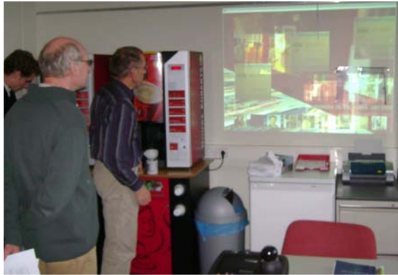
Figure 6: Staff members interacting with Panorama

the speed, movements and presentation of these objects provides indications of the kind of mood or emotion the department is going through, e.g. normal, idle, or chaotic. Figure 6 shows an instance of staff members interacting with Panorama for the first time.