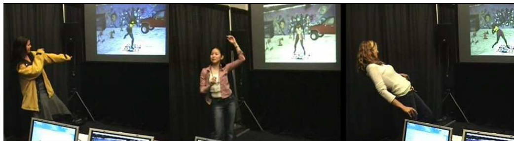
Figure 8: Virtual Dancer installation at a conference

Virtual reality's ultimate aim seems to be to create real-life simulated experiences. On the other hand, it shares with cinema and animation, the effects of play and imagination. The play with the real and the unreal is manifested in both the appearance and the behavior of the virtual characters.